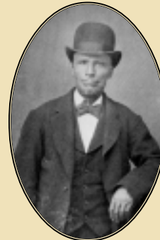
circa 1885